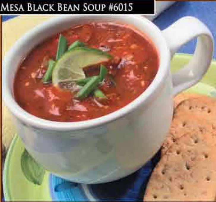
MESA BLACK BEAN SOUP #6015