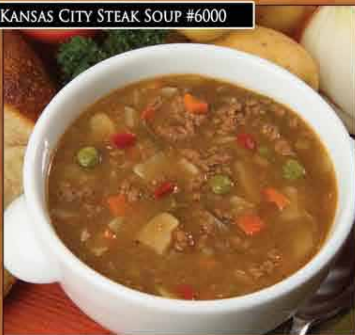
KANSAS CITY STEAK SOUP #6000