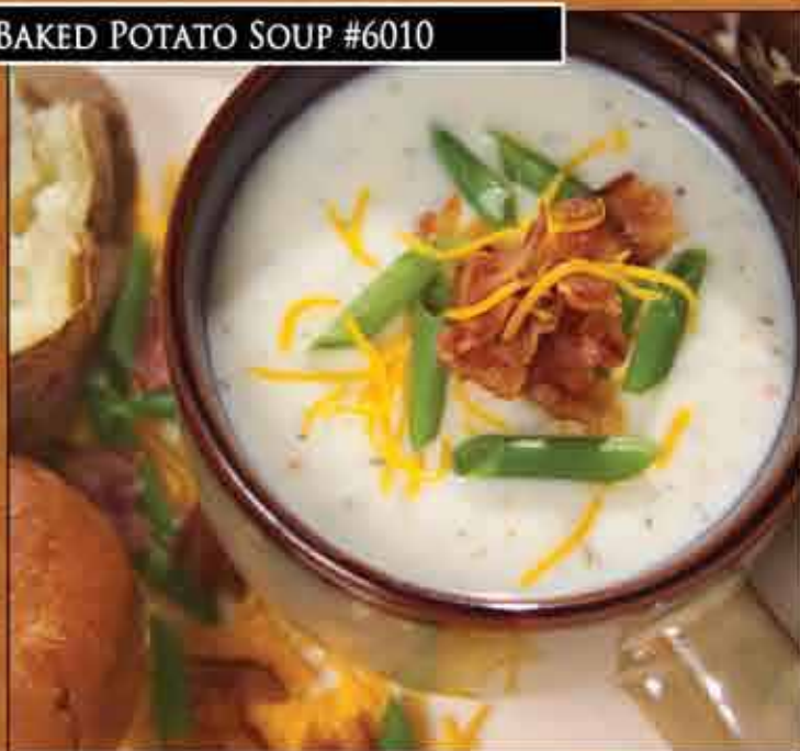
BAKED POTATO SOUP #6010